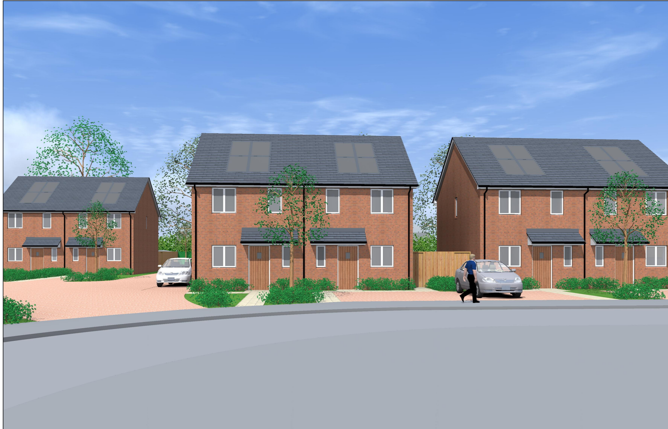
PERSPECTIVE 1 SITE A1