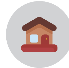
Your own home