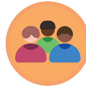
Make new friends

MyPlace could offer the independence you're looking for whilst making sure you have all the care and support you need.