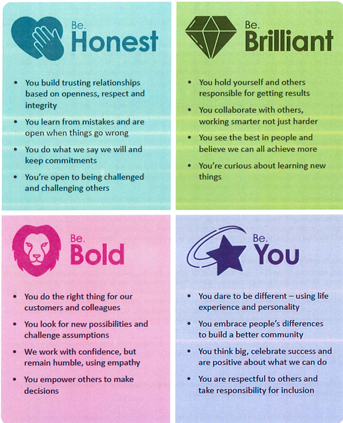
Fig. 1. Bromford DNA