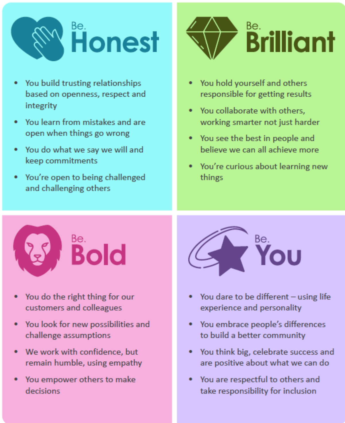
Fig. 1. Bromford DNA